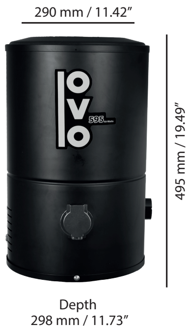
Depth 298 mm / 11.73"