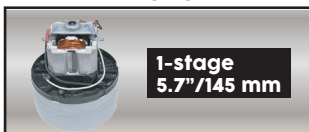
Soft-start / stop technology