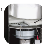
Mandatory permanent protective filter (Rince only) FILPCDO-VAC