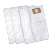
Disposable filtration bags (3-pack) 12.5L 3.2 Gal. FD-12.5L-3OVO