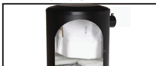
3-Layer disposable bag / Better filtration