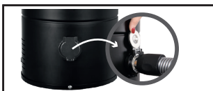
Connect the hose directly to the unit