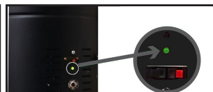
Displays the status of the unit