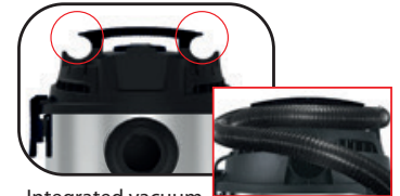
Integrated vacuum hose storage