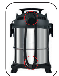
Power cable storage tab